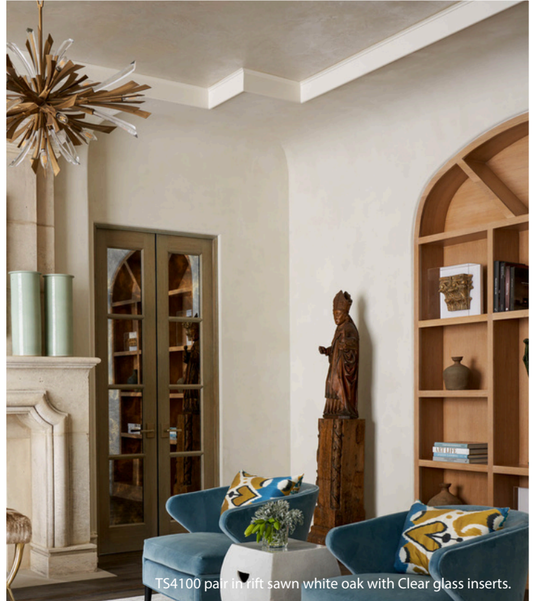
TS4100 pair in rift sawn white oak with Clear glass inserts.

Incorporating paint-grade and stain-grade doors creates a balance between contemporary finishes and Mediterranean charm.