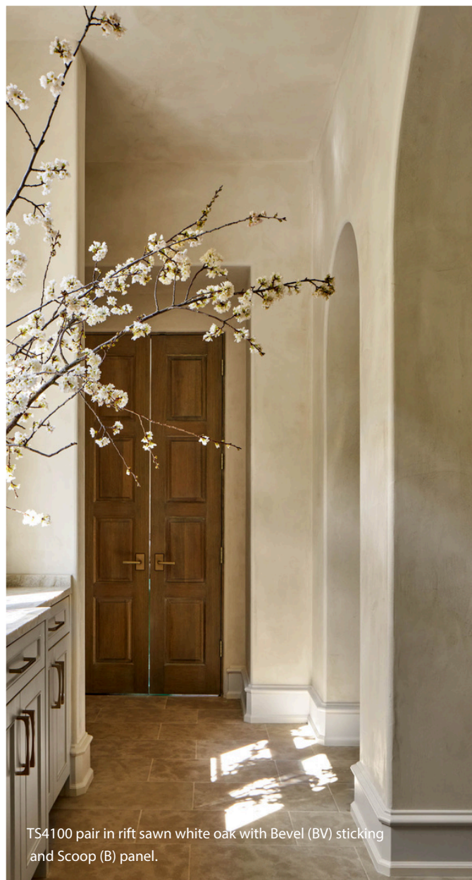
TS4100 pair in rift sawn white oak with Bevel (BV) sticking and Scoop (B) panel.

The home features custom cabinetry, intricate ceilings, and limestone flooring quarried in Morocco. Wood beams reclaimed from a 19th-century Ohio barn add warmth and character to the elegant interiors. Nixon Custom Homes combined TruStile's TS4100, TS8000, and TS8010 doors with Bevel (BV) sticking and Scoop (B) panels to enhance the home's harmonious blend of indoor & outdoor living. These doors perfectly complement the Palladian-inspired style of the home. The Beverly residence is a prime example of how TruStile doors elevate the look, feel, and flow of a home.