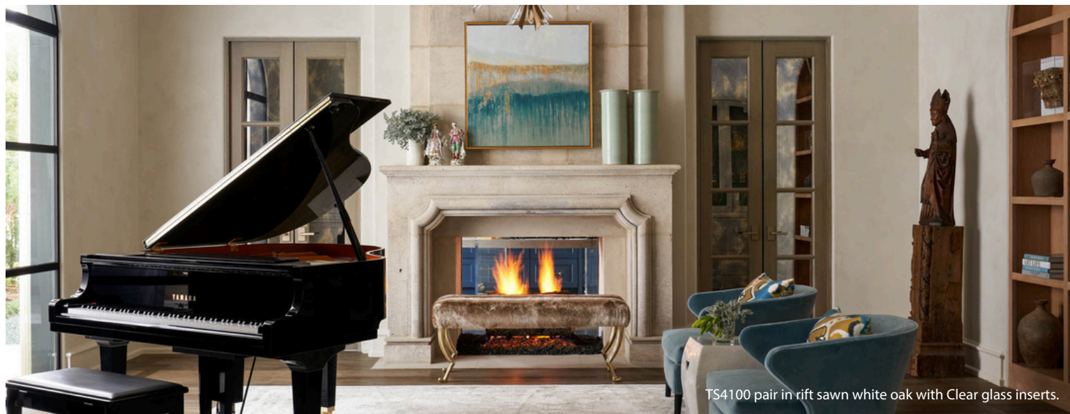
TS4100 pair in rift sawn white oak with Clear glass inserts.