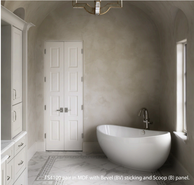
TS4100 pair in MDF with Bevel (BV) sticking and Scoop (B) panel.