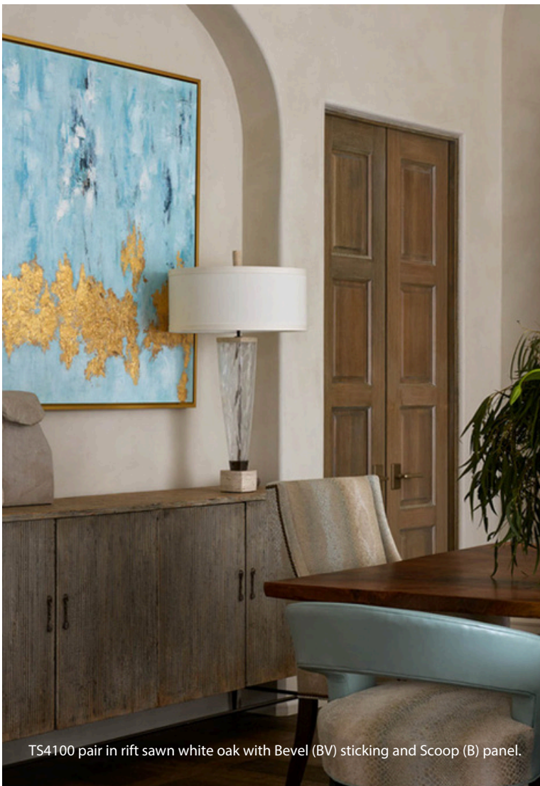
TS4100 pair in rift sawn white oak with Bevel (BV) sticking and Scoop (B) panel.

Incorporating paint-grade and stain-grade doors creates a balance between contemporary finishes and Mediterranean charm.