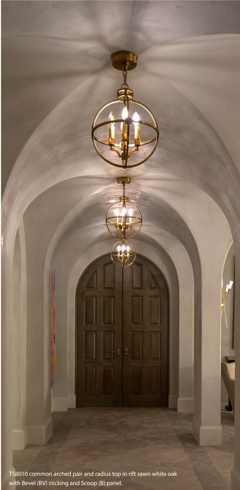
TS8010 common arched pair and radius top in rift sawn white oak with Bevel (BV) sticking and Scoop (B) panel.

Statement doors throughout the home highlight key spaces and provide architectural depth. The grand foyer features a common arched pair that sets the tone and reinforces the home's classic yet contemporary design ethos.