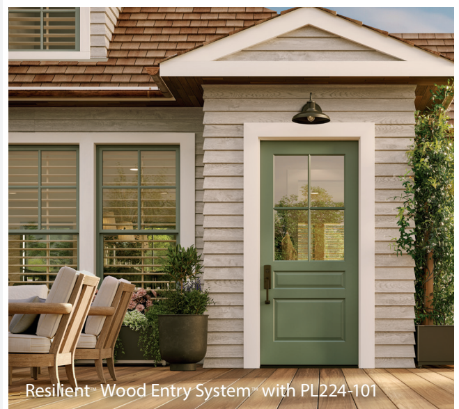
Resilient™ Wood Entry System™ with PL224-101

Contact your TruStile Sales Representative for more information