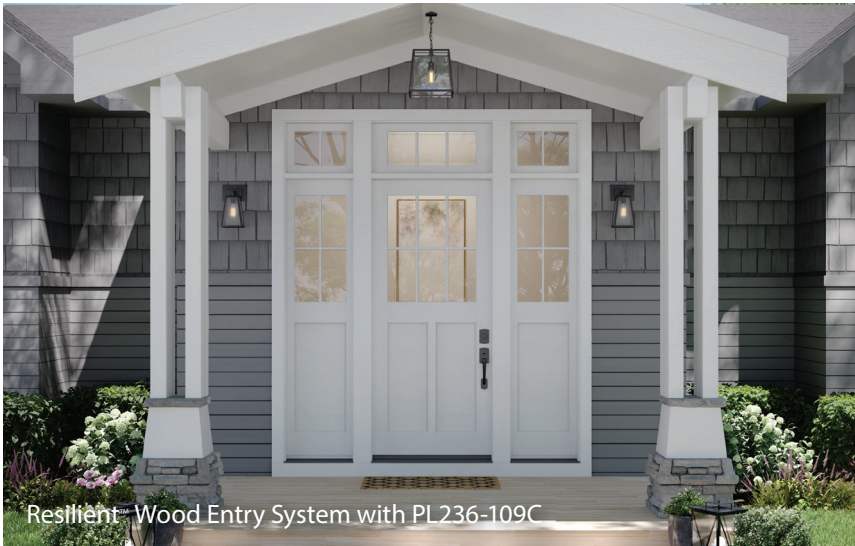
Resilient™ Wood Entry System with PL236-109C