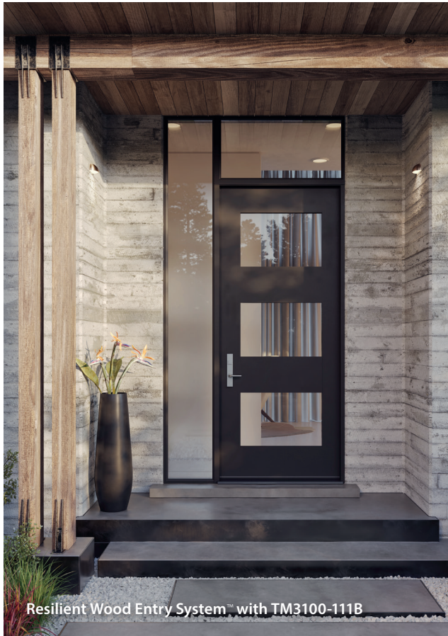
Resilient Wood Entry System™ with TM3100-111B