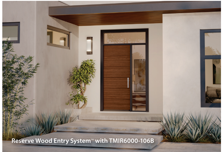
Reserve Wood Entry System™ with TMIR6000-106B