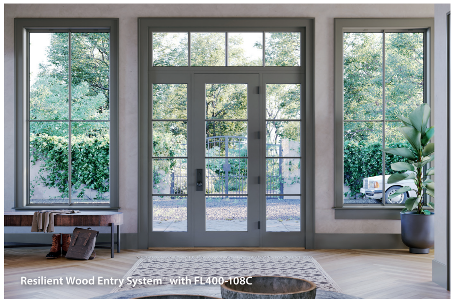
Resilient Wood Entry System™ with FL400-108C

Learn more at www.trustile.com/elevate .