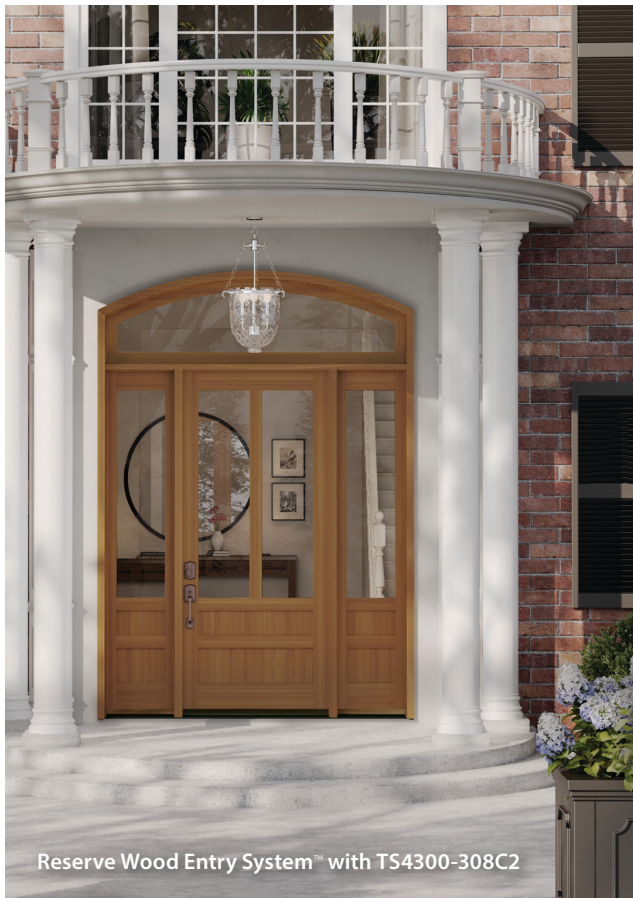
Reserve Wood Entry System™ with TS4300-308C2