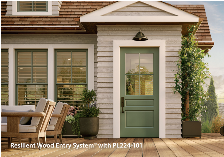
Resilient Wood Entry System™ with PL224-101