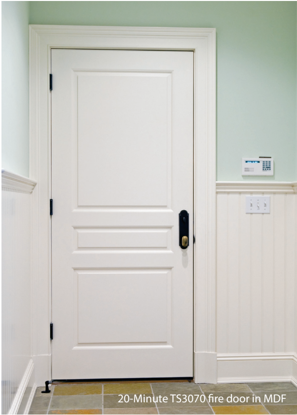
20-Minute TS3070 fire door in MDF

Throw away the preconception that you have limited design options for fire-rated openings. With hundreds of styles and custom configurations available, TruStile ensures you will never sacrifice style when selecting 20- through 90-minute fire doors.