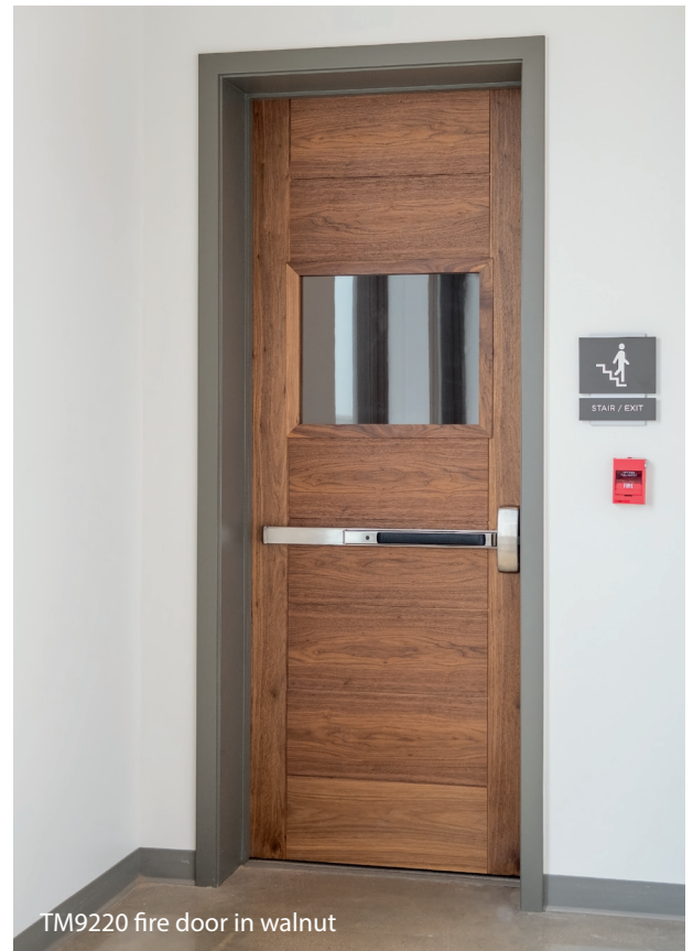
TM9220 fire door in walnut

TruStile can work almost any custom design feature into our 20- through 90-minute doors. Send us your desired design and fire rating and our engineers will show you how we can carry it through all of the doors on your project.