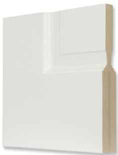
60-Minute Fire Door