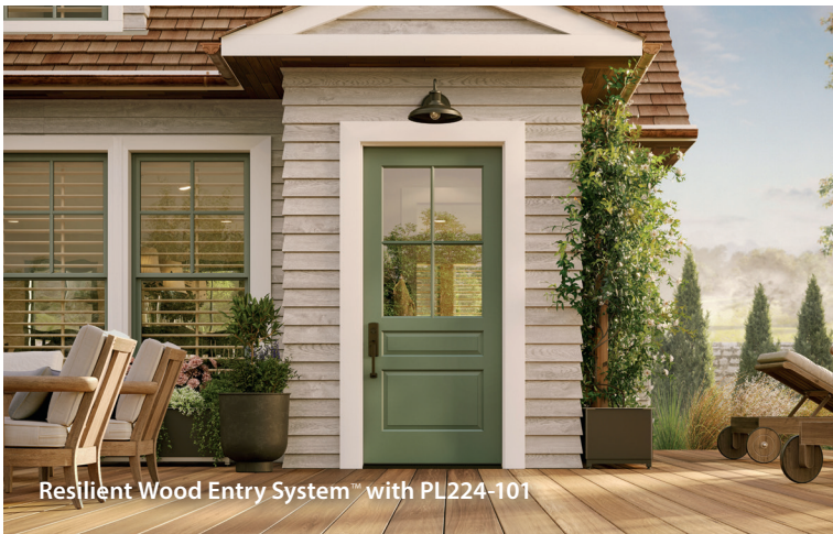
Resilient Wood Entry System™ with PL224-101