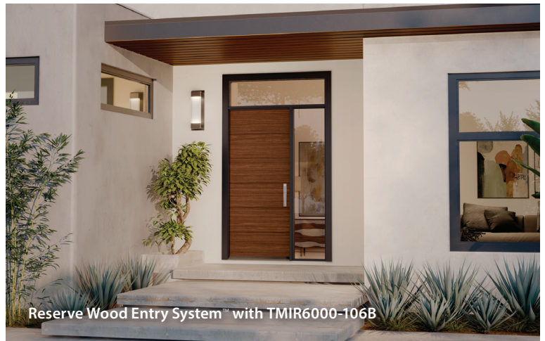
Reserve Wood Entry System™ with TMIR6000-106B