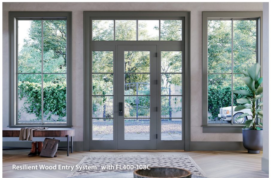
Resilient Wood Entry System™ with FL400-108C