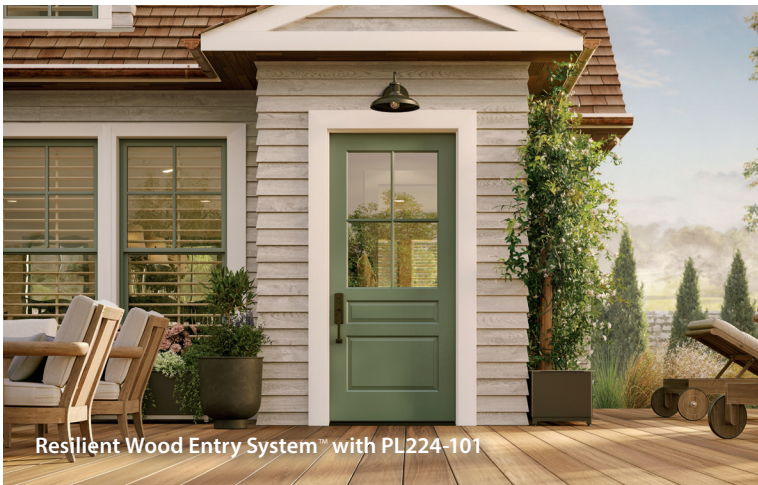
Resilient Wood Entry System™ with PL224-101