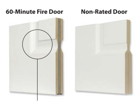
Profiles on fire-rated doors have true depth and definition, not plant-on mouldings

You no longer need to settle for flush doors with plant-on mouldings when it comes to fire doors. All TruStile fire doors feature full panel relief and are carefully engineered to match our non-rated doors.