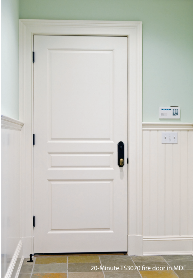
20-Minute TS3070 fire door in MDF

Throw away the preconception that you have limited design options for fire-rated openings. With hundreds of styles and unlimited custom capabilities, TruStile ensures you will never sacrifice style when selecting 20- through 90-minute fire doors.