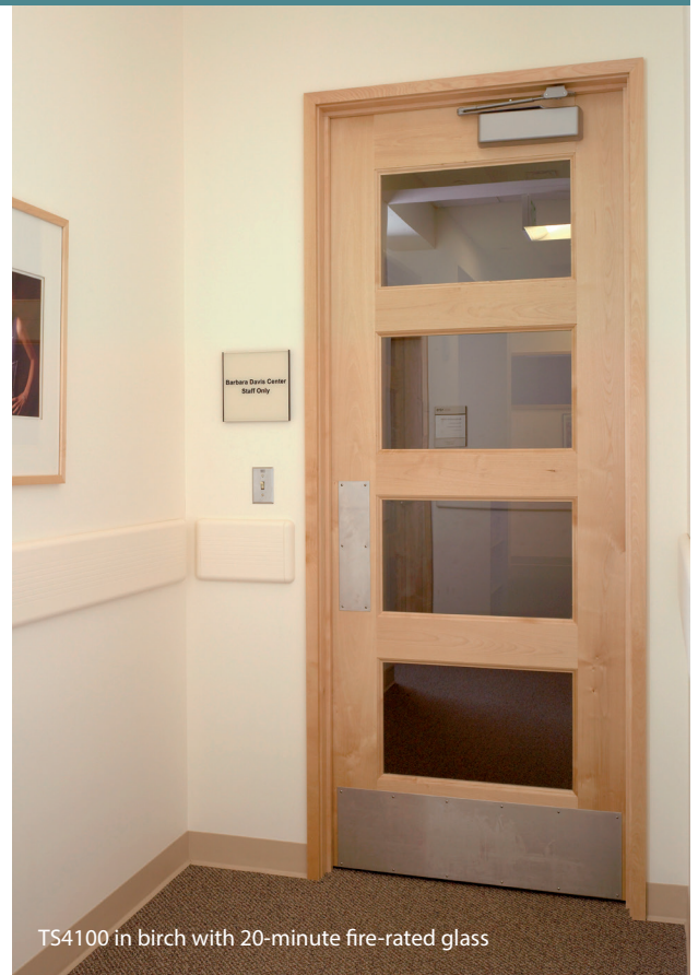
TS4100 in birch with 20-minute fire-rated glass

TruStile can work almost any custom design feature into our 20- through 90-minute doors. Send us your desired design and fire rating and our engineers will show you how we can carry it through all of the doors on your project.